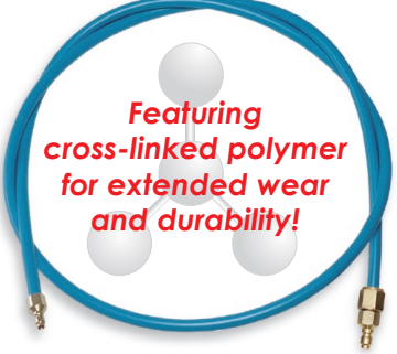
BLUE POLYMER CONDUIT Shown as cut length with connector options