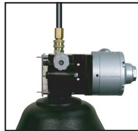
PFA-LM-L Side View

See ELCo Catalog or visit www.wire-wizard.com for Inlet Guide options